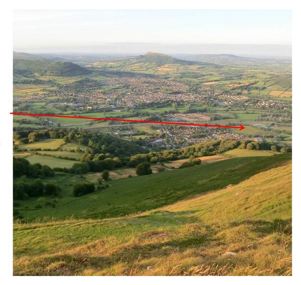
This is the site for Mcdonalds seen from the top of Blorenge Mountain in the Blaenavon World Heritage Site. Clearly visible

The application includes no assessment of the specific impact of a highly visible – and lit – 24 hour drive through fast food outlet. In 2010 consent was given to application (DC/2008/00818) – titled somewhat misleadingly as Full - Improvements to Highways and Drainage Networks and Outline – Residential Development .The outline consent application makes very broad reference to commercial development and employment use. It is only in the Addendum to the Transport Assessment that references to specific types of development are made and these are only as a basis for calculating traffic data. The traffic projections have been based on the following: - builders' merchant, 70 Bedroom Hotel with restaurant and leisure facilities 65 private dwellings Fast Food Outlet Business Park (27 units).